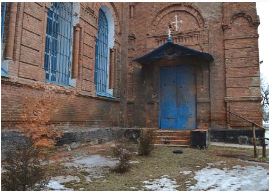
Church damaged with shelling in Trohizbentsi

"The broken churches with destroyed altars and icons is a visual proof on what" Orthodox world" the Russians and their mercenaries in Donbass are fighting", - said Gennady Moskal 167 .