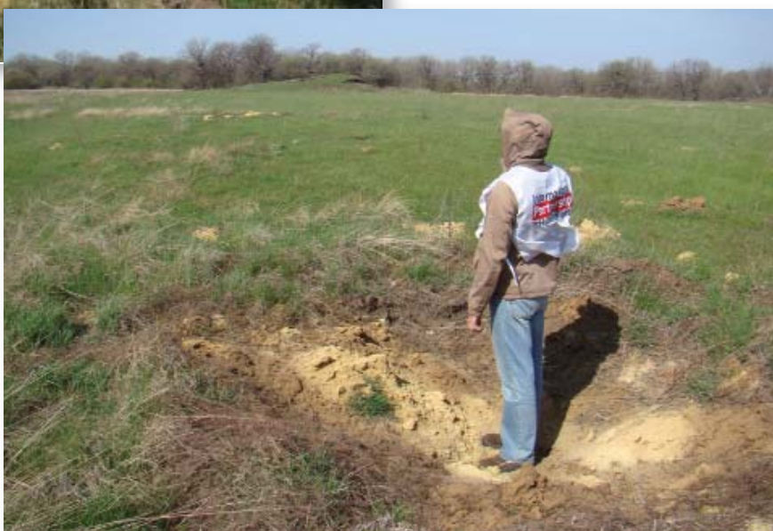
Photo: crater from shell near the tumulus group