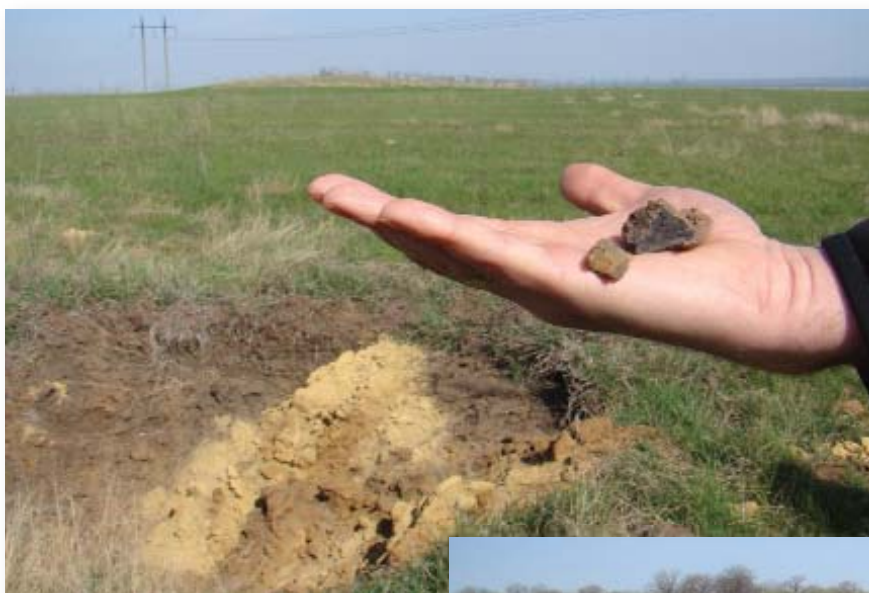
Photo: pieces of ammunition with which the tumulus territory was shelled