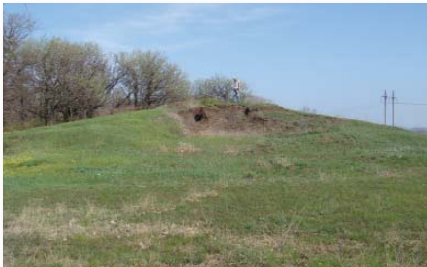
Photo: trenches in the body of the tumulus, which were used as observation point