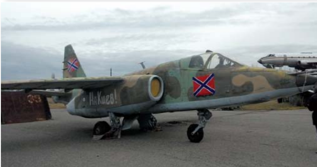
Su-25 aircraft.