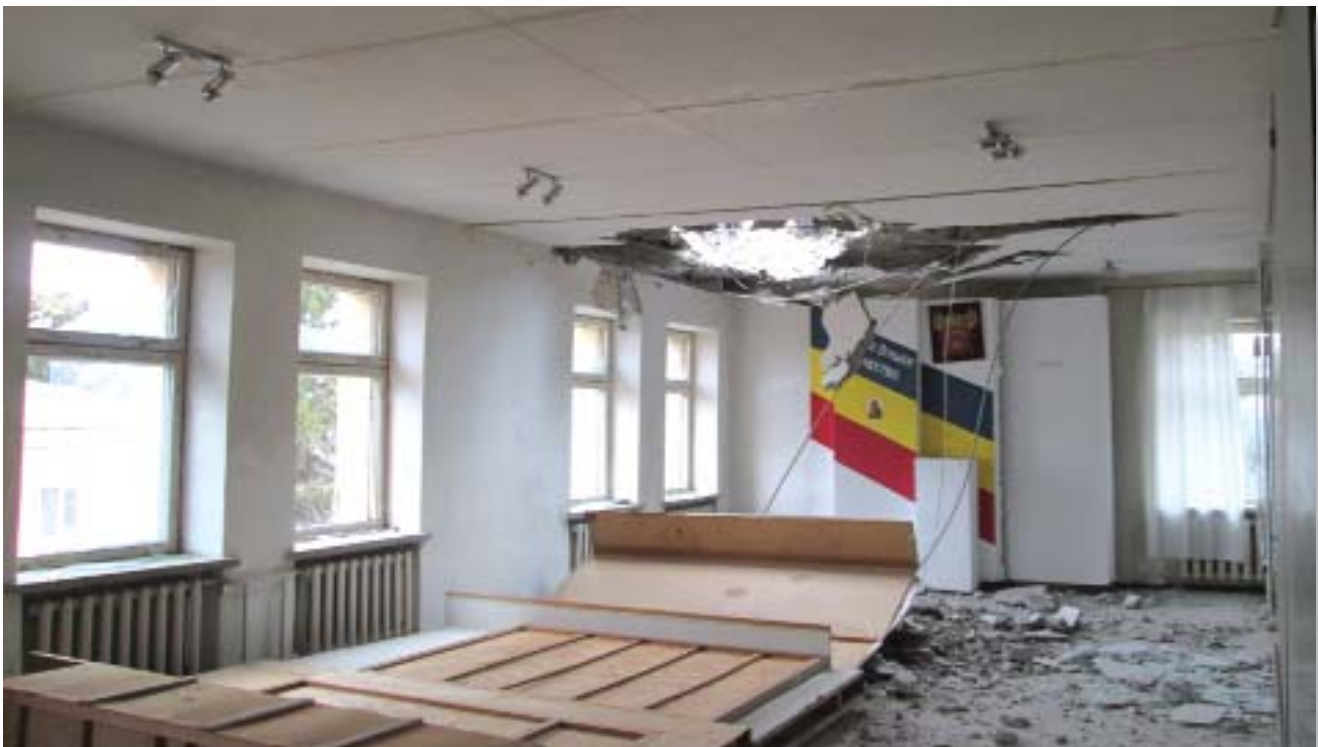
Photo: 1st floor of the Local History museum in the village Stanitsia Luhanska

By the results of the inspection of the state of the Local History Museum in the village Stanitsia Luhanska and interviewing of its staff it was found that the museum suffered from direct shell hit during the shelling of the village (as evidenced by the testimony of the staff of the museum and the photo of damage. In addition, the museum staff during the interviews pointed out to the robbery of the museum collections (it was stolen about 100 cultural items). In addition to the museum other civilian sites were damaged. The museum was not marked with distinctive emblems in accordance with the Hague Convention of 1954, although the plate which proves the purpose of building for the concentration of cultural property was attached to it.