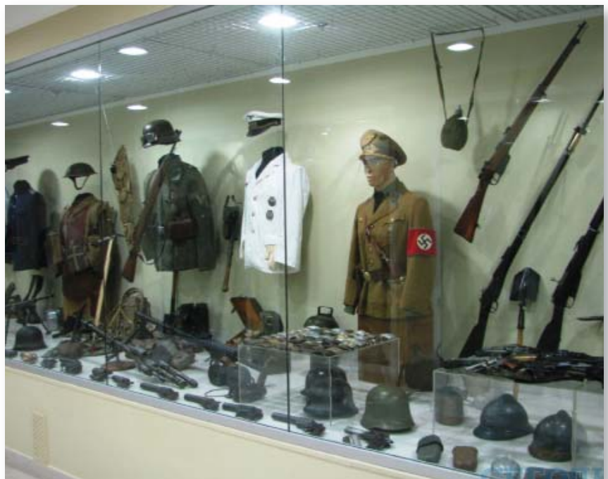
Exposition at the opening of the Museum of WWII in 2012.