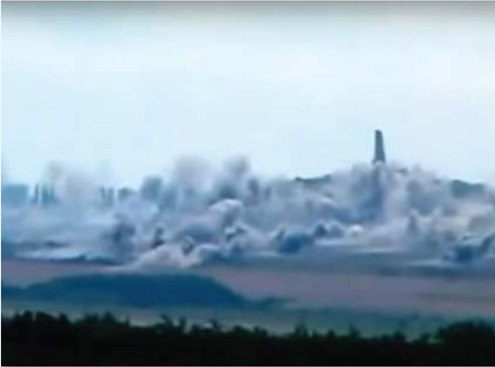
Screenshot from video of shelling of Savur- Mohyla. 133