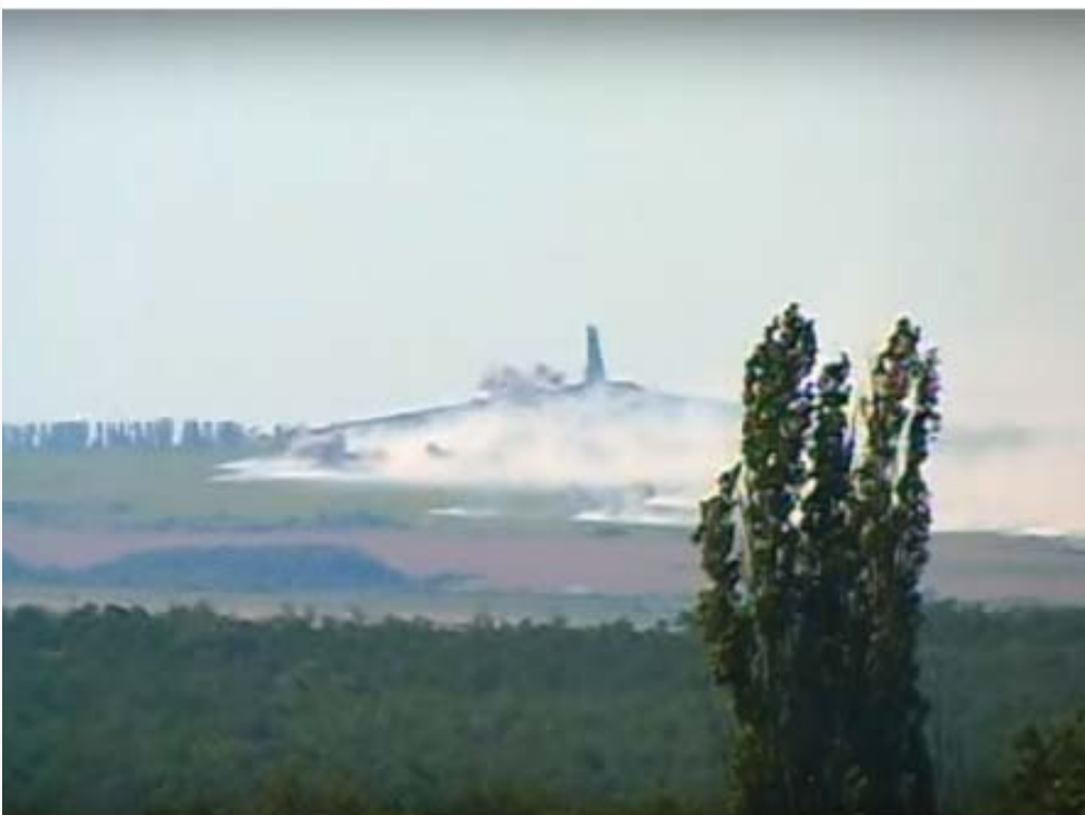
Screenshot of the video, which captured fighting for Savur-Mohyla of July 1, 2014. 134