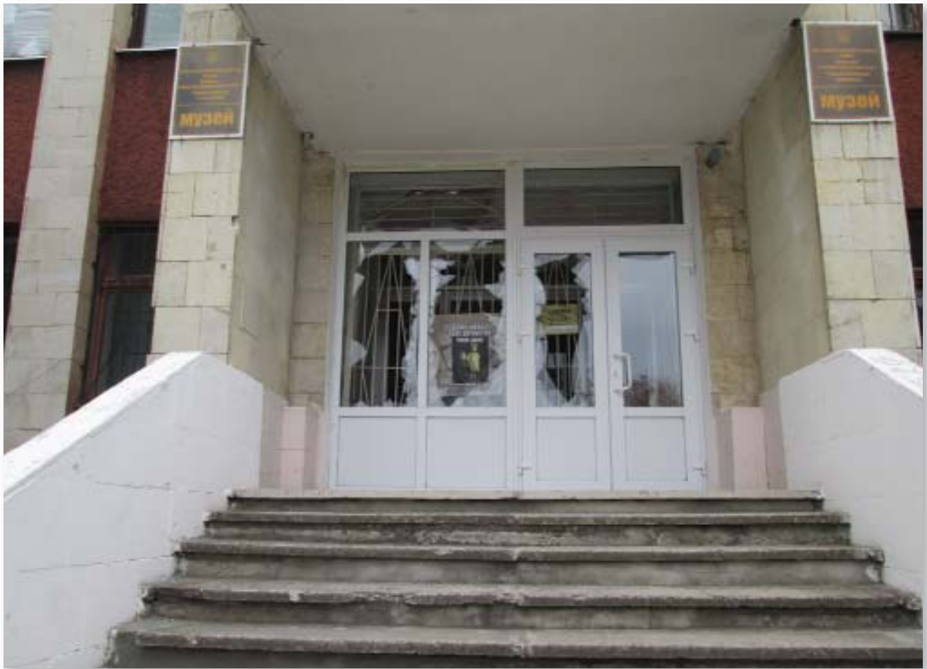
Photo: Main entrance of the Local History Museum in the village in the village Stanytsia Luhanska

In the city of Lysychansk there were interviewed internally displaced persons, former employees of Luhansk regional Local History museum. They told that the museum, the same as other nearby civilian sites was damaged as a result of shelling. Direct shell hit to the museum provoked a particular significant damage to one of the show rooms of the museum. Water leaking damaged pieces of fine art kept in the museums. In addition, at least twice the museum was robbed, an unknown number of items that were there in storage or in exhibitions was taken from it. To identify the list of taken out items is almost impossible, as the person responsible for keeping the register of collections, died during the shelling, and registers themselves exist only at site and only in a non-electronic version. The museum was not marked with an distinctive emblem in accordance with the Hague Convention of 1954, the plate which proves the purpose of building for the concentration of cultural property was attached to it.