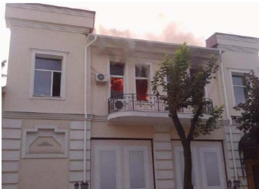
Palayuchy Budinok №6 on vulitsi Karl Marx in Luhansk

June 15, 2014 armed militants ransacked the office premises of the "New Generation" Evangelical Church in Gorlivka town, Donetsk region. From the office there were taken away computers and other office equipment, as well as statutory