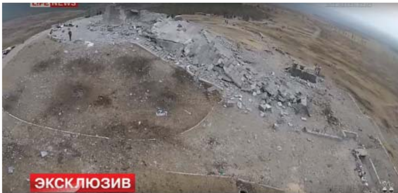
Videopanorama, filmed from unmanned aerial vehicle, which shows the ruins left after the memorial. 135