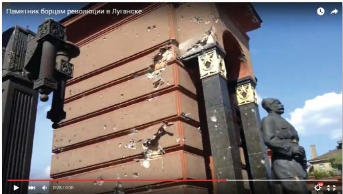
Video: Ksenia God at Youtube

The memorial complex "Fighters of Revolution" is a site of a national value, entered into the register of monuments of history by the Resolution of the Cabinet of Ministers of Ukraine No 1761 of December 27, 2001. It was built in 1936, renovated in 1945 and 2010. It is a colonnade with full-height sculptures of Parkhomenko A. and Tsupov P. at the edges. On the tables there are names of those killed in the civil war. In front of colonnade there is the eternal fire. Across the road, opposite the colonnade on the sides of the fountain there are two British tanks Mark-5, restored in 2010. The Architect Sheremet O.S., sculptors Shilnikov M. and Rabinowitz M. Made of labradorite marble. In 2013, its condition was rated as good, and the protection plate was installed 156 .