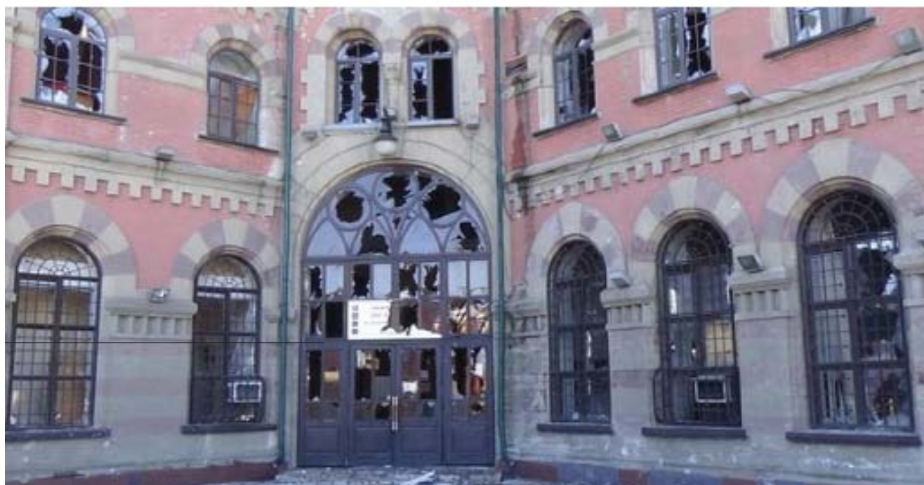
Railway station after shelling.