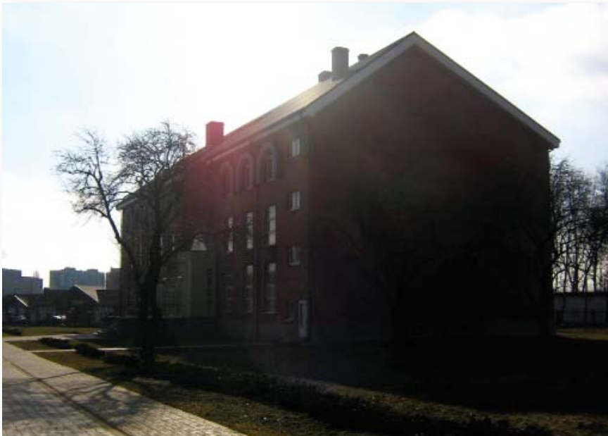
Donetsk Christian University.