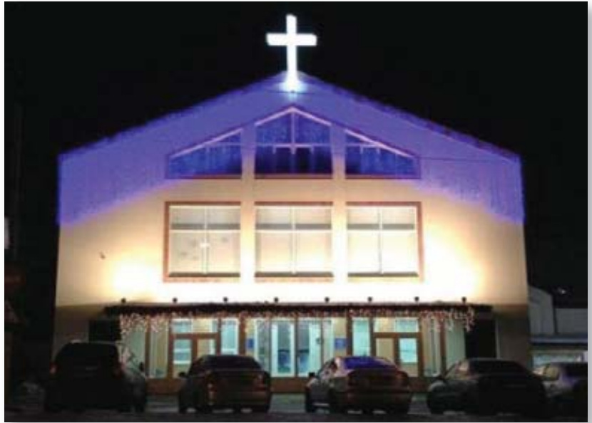
"Word of Life". Church