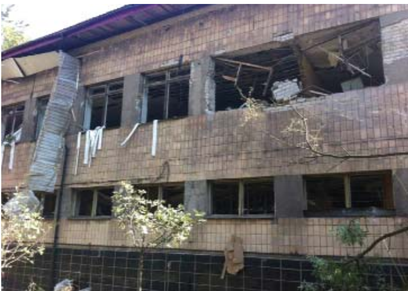
Ruined building of the museum.