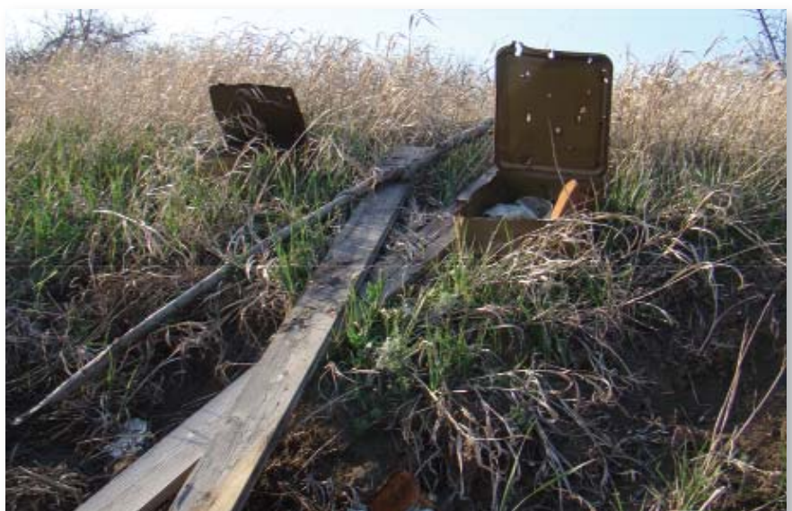
Photo: boxes for ammunition on the tumulus, used as targets in a makeshift shooting range

In the vicinity of the two groups of tumuluses there were found many craters from MRL "Grad" shells (on the boundary of villages Toshkivka and Vru-