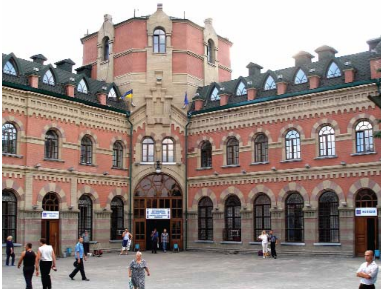
Railway Station before the war.